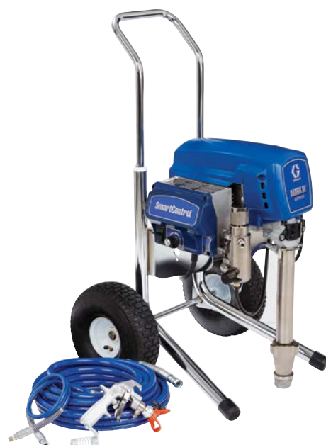
Mark IV Express